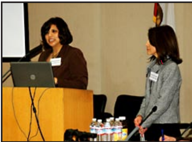
Speakers From San Jose.

Sonoma County presented their Sonoma County Energy Independence Program, SCEIP. The county loans funds at a 7% rate to businesses and individuals for energy savings projects such as installing solar panels,